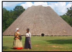
Mission San Luis