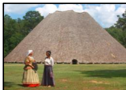
Mission San Luis